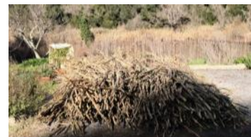
Arundo pulled from the riverbank by Redwood Drive (January 2023)