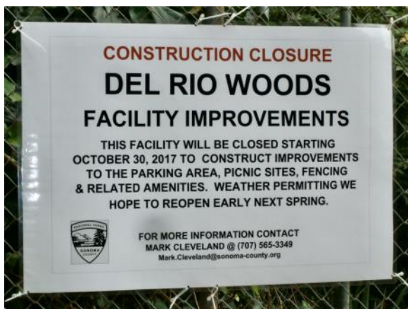
A look back....

After the first round of Del Rio improvements in 2017, there wasn't enough money to complete three components of the overall project: (1) an ADA-compliant pathway from the parking lot to the edge of the gravel bar, (2) an ADA-compliant stairway replacement, and (3) an interpretive sign describing the history of Del Rio Woods and another on local flora and fauna. So we had to wait for more funds to accumulate. FMA's Del Rio Committee recently learned that Regional Parks has begun exploring these delayed pieces of the project. The first step will be penciling out costs of things like concrete and lumber. If funds are sufficient, they will request proposals to do the work and bid the jobs. So, improvements are coming, but don't plan to use the new stairway until maybe 2025.