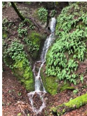
"Fern Falls" photo by Rhonda Bellmer